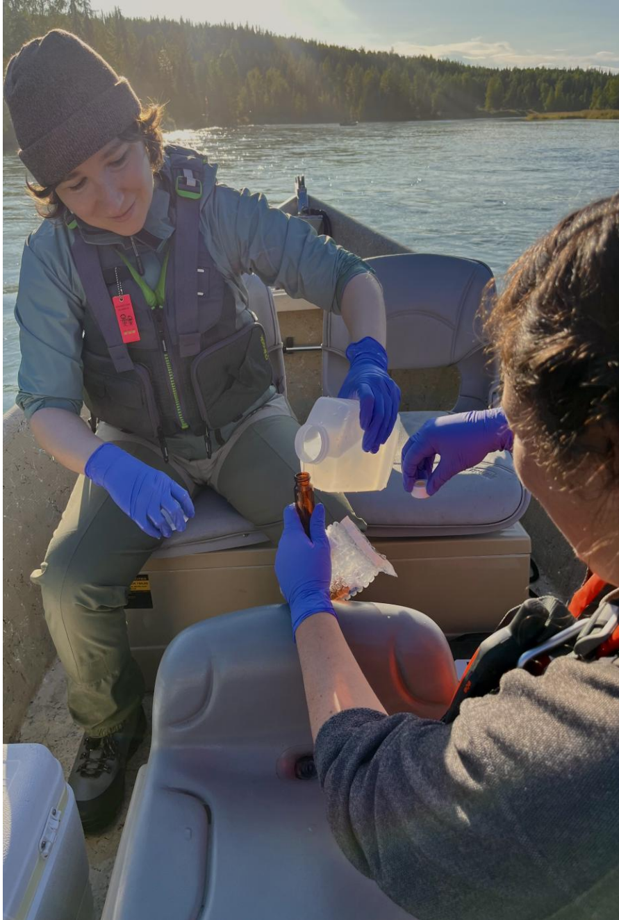
Alaska Department of Environmental Conservation staff collect water samples on the middle Kenai River in 2025.