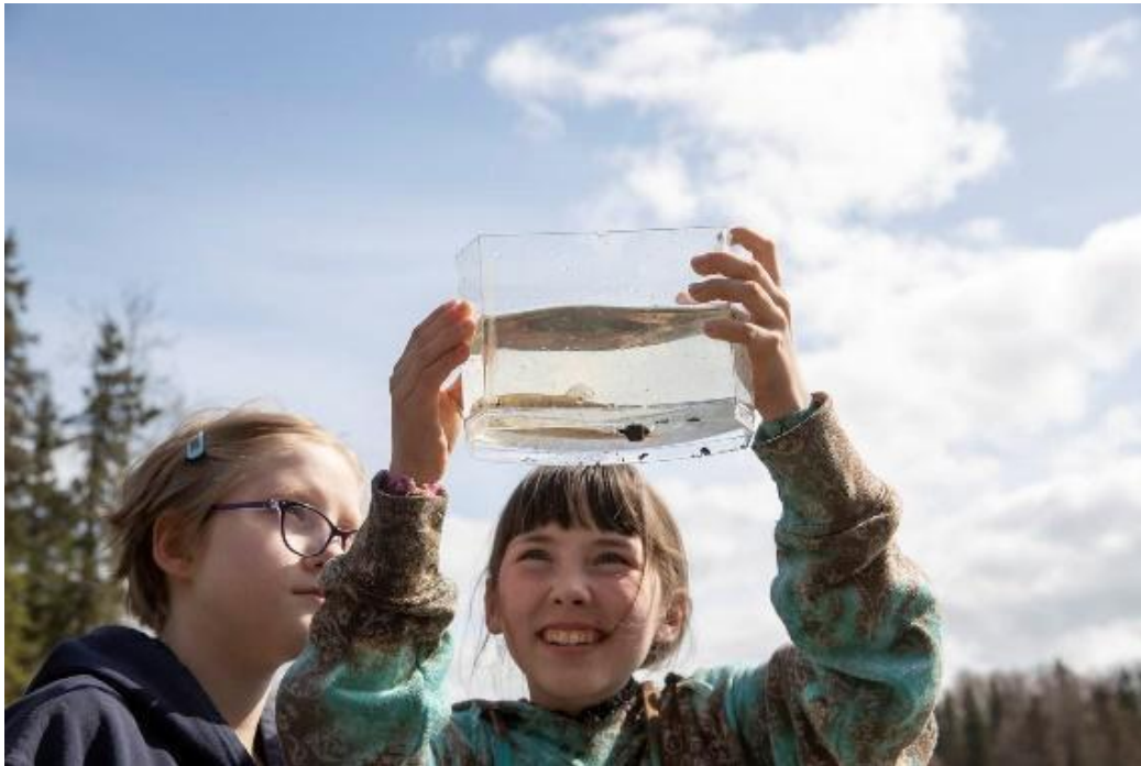
A student holds up a juvenile salmon near the Kenai River

*Note: this is the first in a series of essays addressing the state of freshwater salmon habitat mapping efforts in Alaska. This first article is for a more general audience, and the second is for a more technical audience. Essays may be accessed at https://www.kenaiwatershed.org/news-media/mapping-alaskas-salmon-streams/