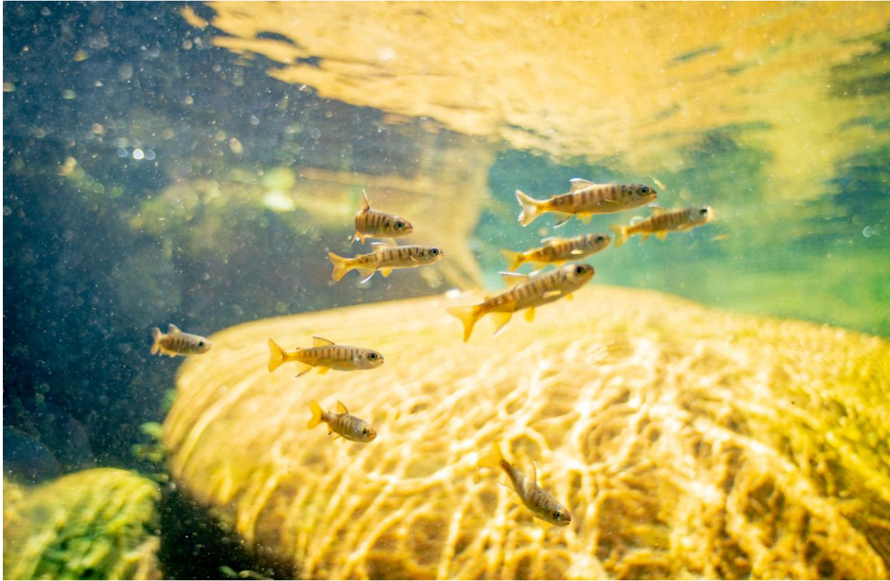
Juvenile salmon.

As Alaska grows and we balance the needs of growing communities and wild fish habitat in our backyards, arguably not every single wild salmon stream is destined for perfect preservation. But we owe it to ourselves to have good information about where wild salmon live to make informed decisions.